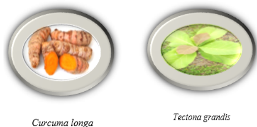
Figure 1: Curcuma longa rhizome and Tectona grandis leaves